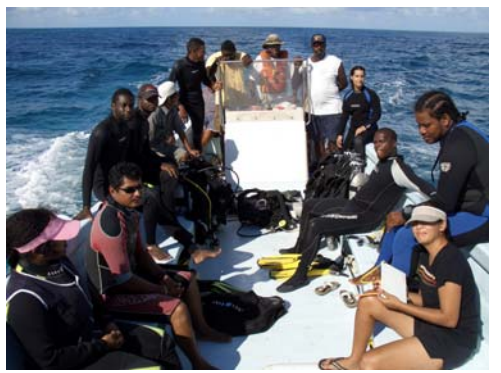
Refresher course participants at Glover's Reef

Finally, the Fisheries Dept. produced a report in June 2005 that presents the results of the MBRS-funded, one-year (February 2004 – January 2005) monitoring of 4 sites: Rocky Pt., Sandbore, Caye Glory/Emily, and Nicholas Caye. The report shows the abundance, size classes, and seasonality for the many species that